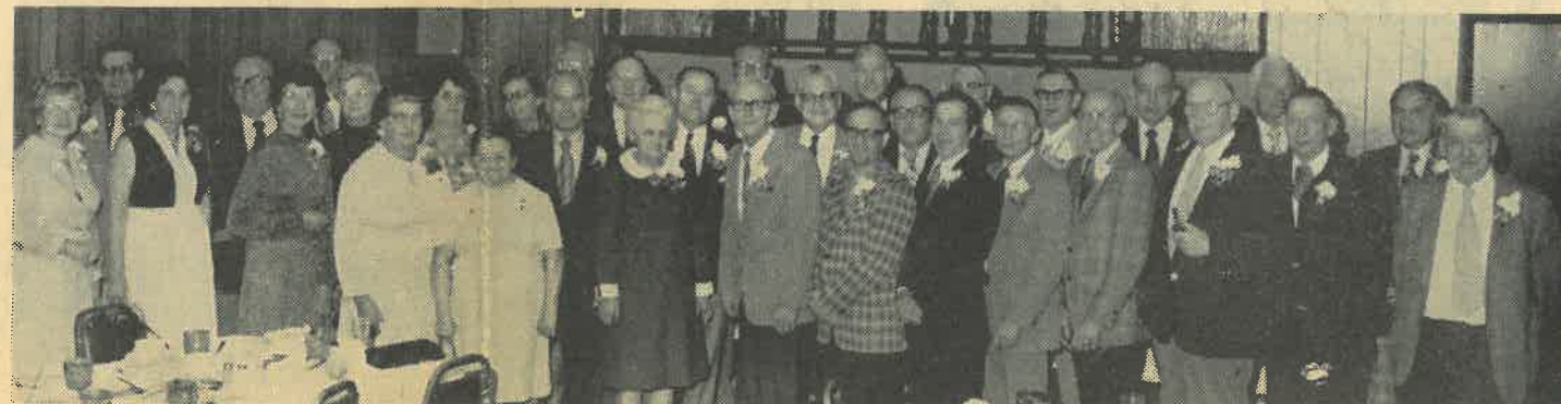
These Haeger employees have completed 25 or more years of service at the potteries.