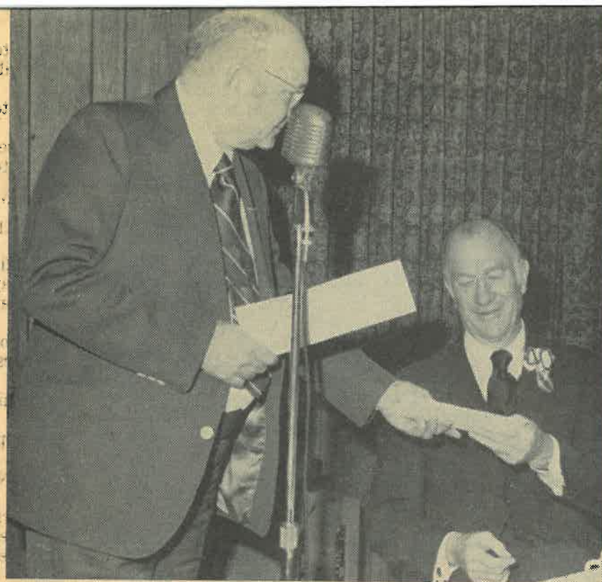
The sales organization also had a check for Summit School in the amount of $1,115.